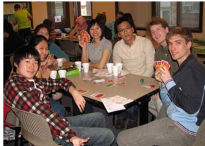
Convopartner Game Night